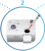
2 Transfer sample to cartridge