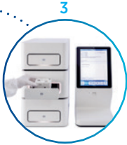
3 Insert cartridge and start test

Just add your sample. Idylla™ will take care of the rest. Our fully automated system enables result reporting within 65 to 180 minutes depending on the assay.