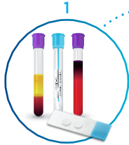
1 Obtain sample